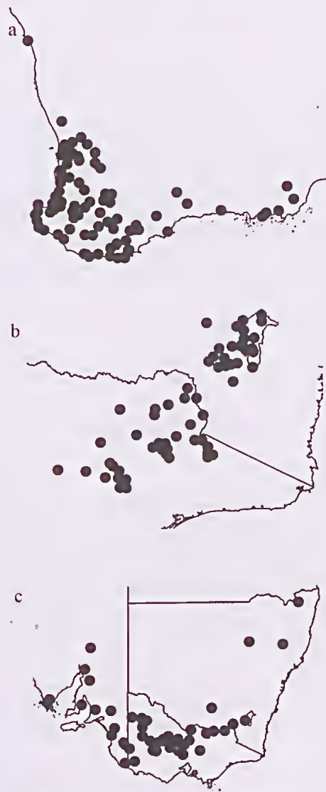
Figure 6. Distribution of a. Thelymitra macrophylo ; b. T. alpina ; c. T. megalyptra

Notes: Plants consistent with Fitzgerald's description, illustration and notes on Thelymitra megalyptra , and with the type collection, can still be found in southern New South Wales in the vicinity of the type locality and have been collected recently and studied. This taxon is relatively common and widespread throughout much of inland south-eastern Australia, but remains poorly known today due to the presence of several superficially similar taxa. The degree of inflation of the post-anther lobe is variable within and between populations,